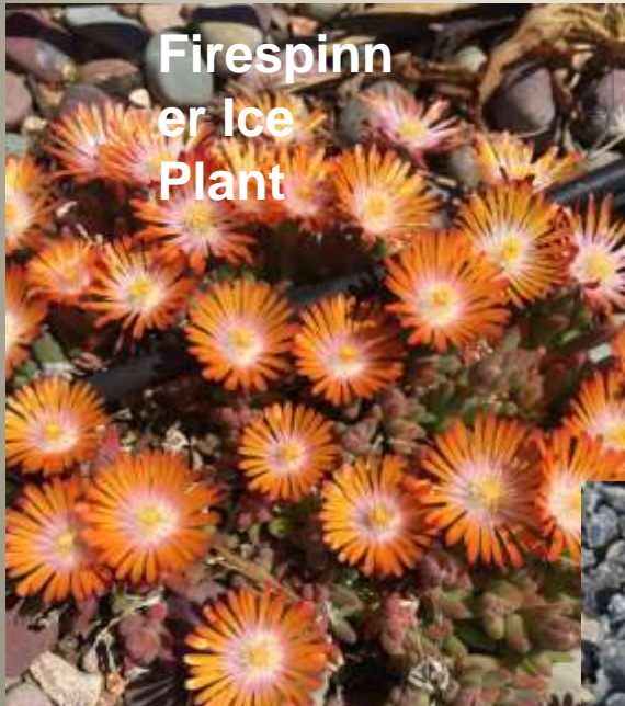
Firespinner Ice Plant