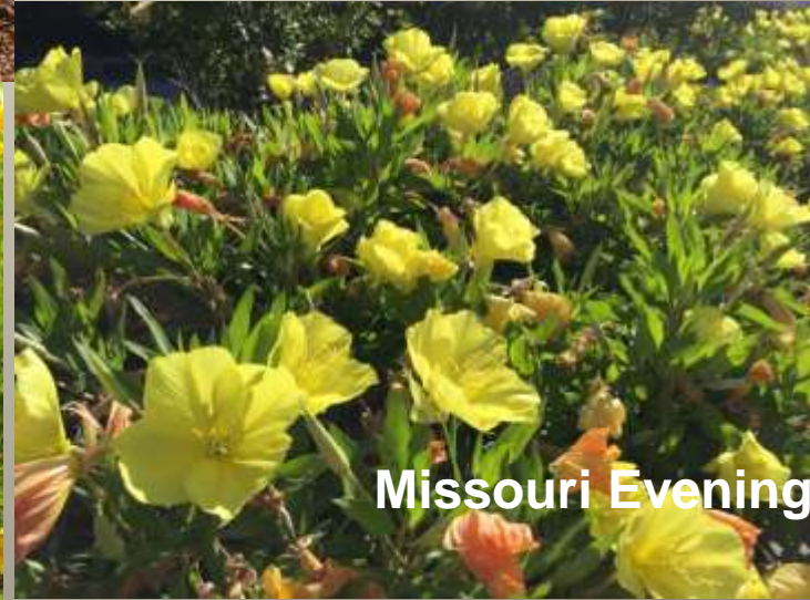
Missouri Evening Primrose