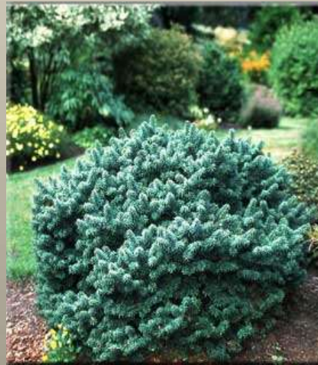
Dwarf Balsam fir

Globe Blue Spruce & others. Fun, with Limited spaces.