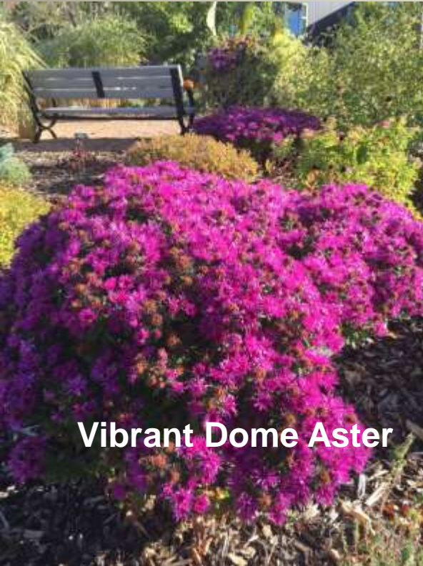
Vibrant Dome Aster