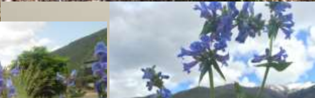
Rondo Mix Penstemon