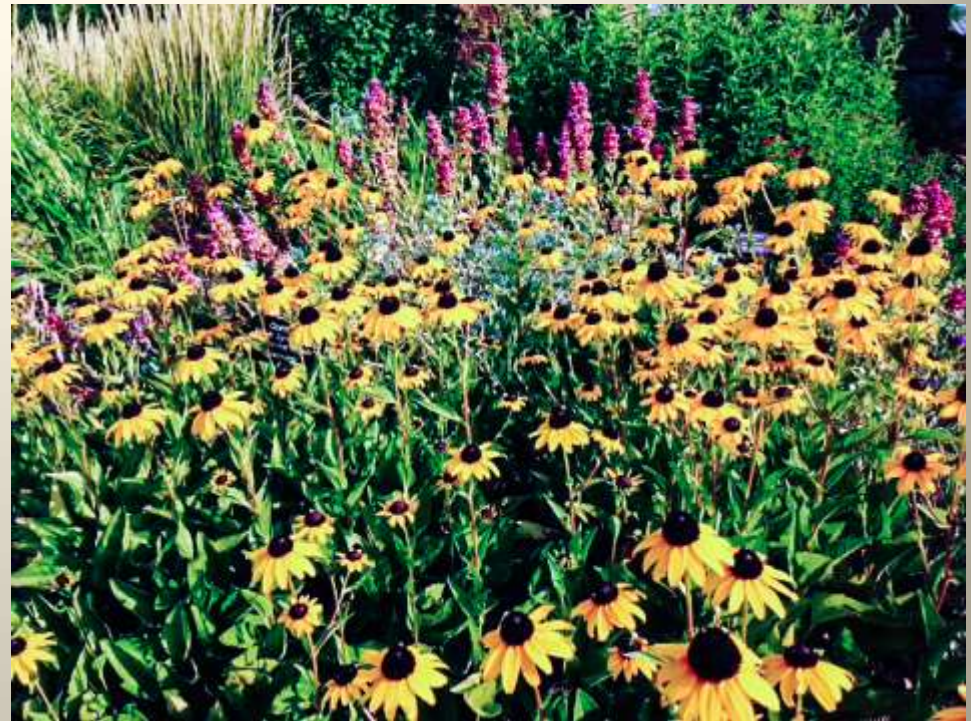
Black Eyed Susan, Blue Flame Sage, Feather Reed Grass, Lemon Queen Sunflower

Look for good Perennial Combos: Look around the neighborhood, Public Gardens nurseries, etc. to get ideas