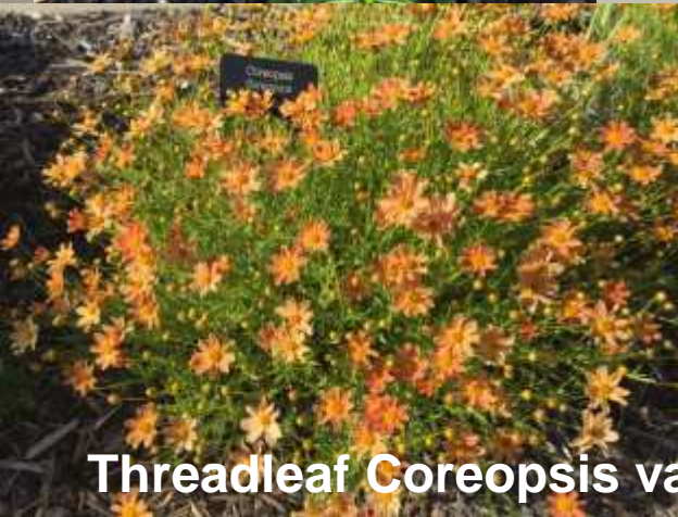
Threadleaf Coreopsis var.