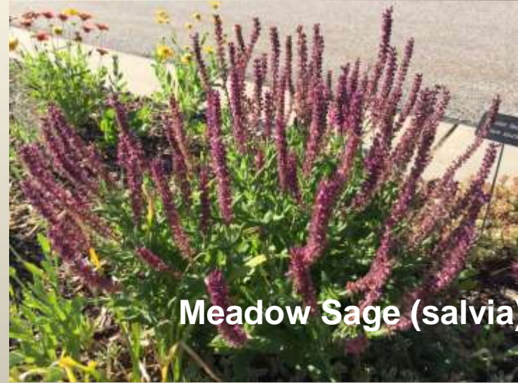
Meadow Sage (salvia)