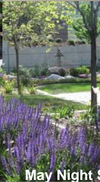
May Night S