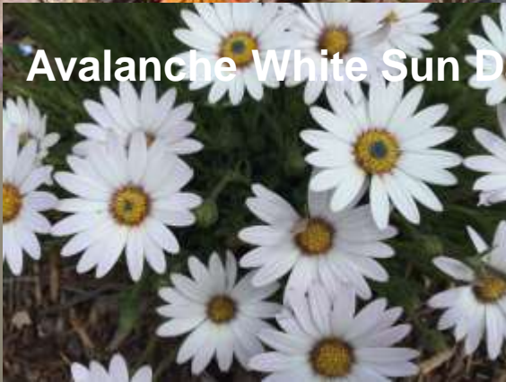
Avalanche White Sun Daisy