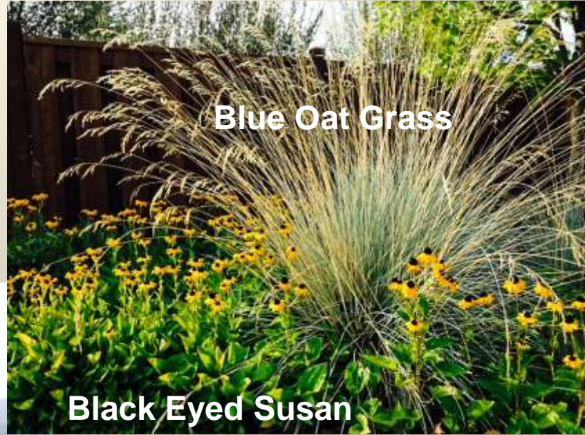
Blue Oat Grass