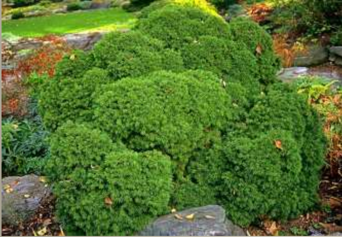
'Diffusa' Norway spruce