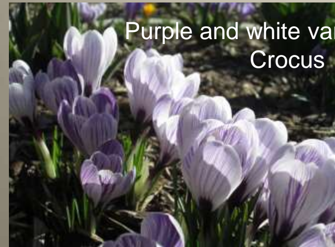
Purple and white variegated Crocus