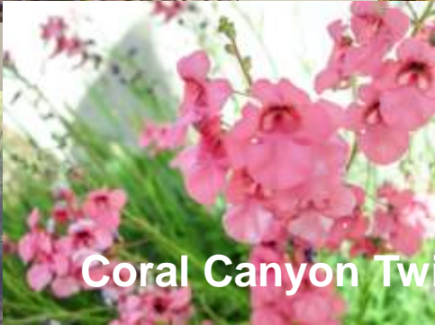
Coral Canyon Twinspur