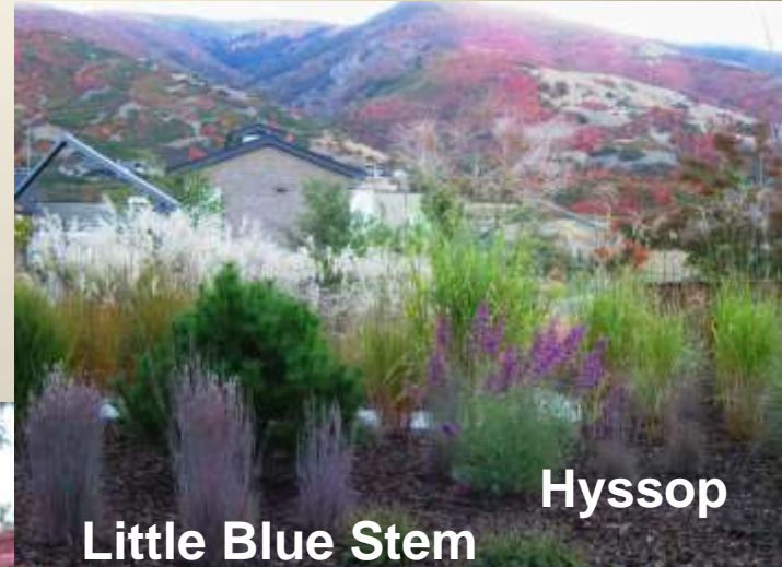
Little Blue Stem