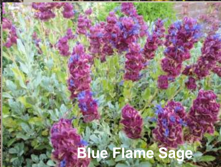
Blue Flame Sage