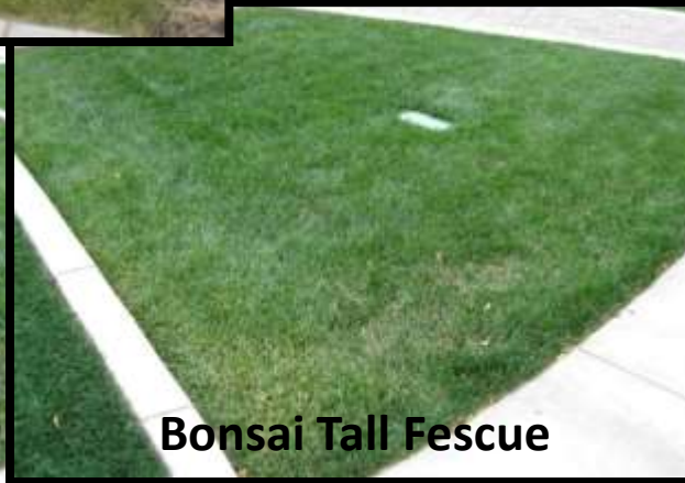
Bonsai Tall Fescue