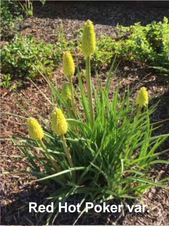
Red Hot Poker var.