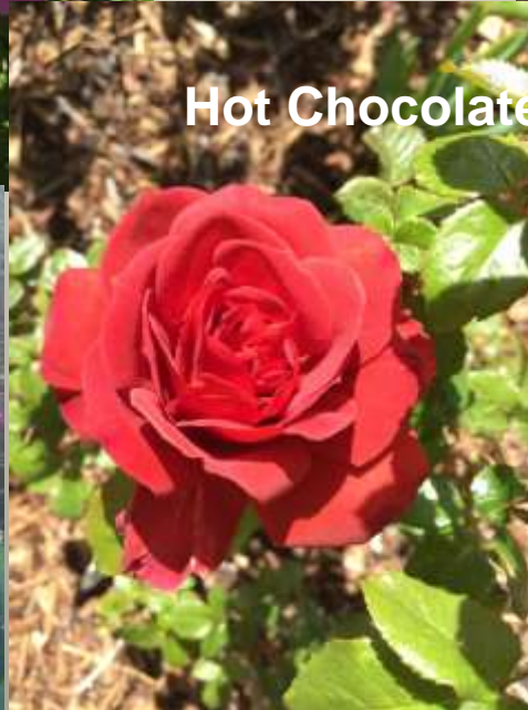
Hot Chocolate Rose