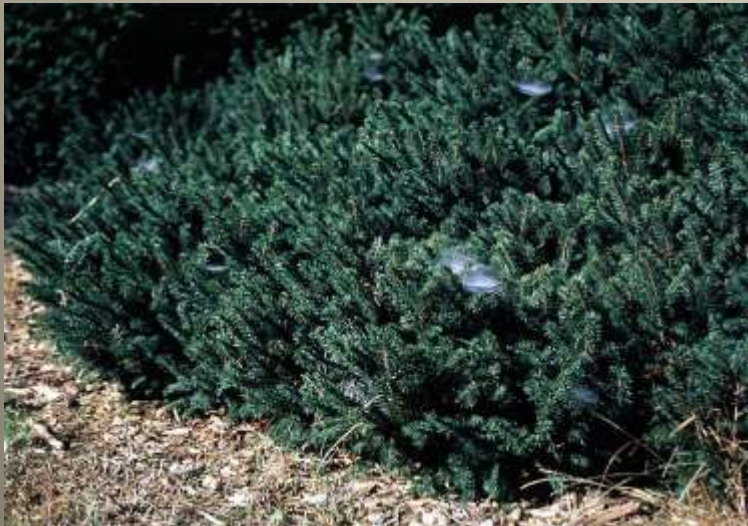
'Pumila Nigra' Norway spruce