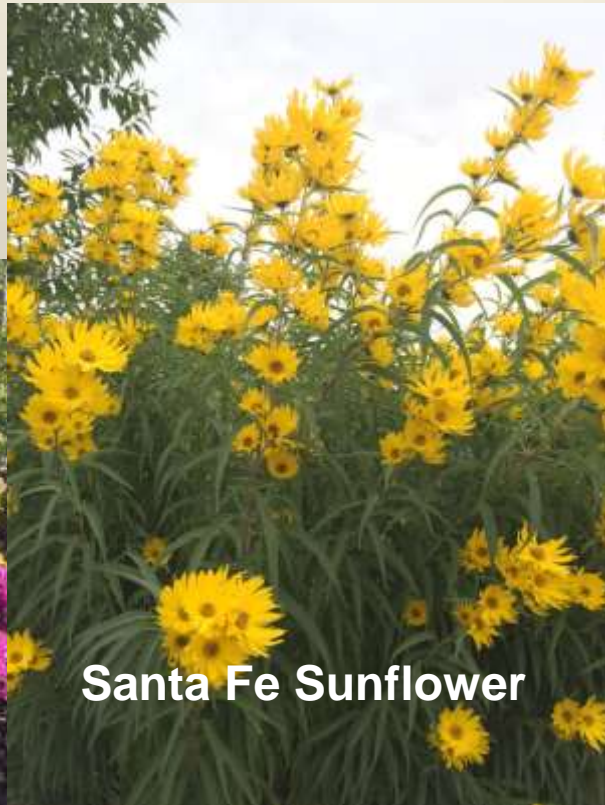
Santa Fe Sunflower