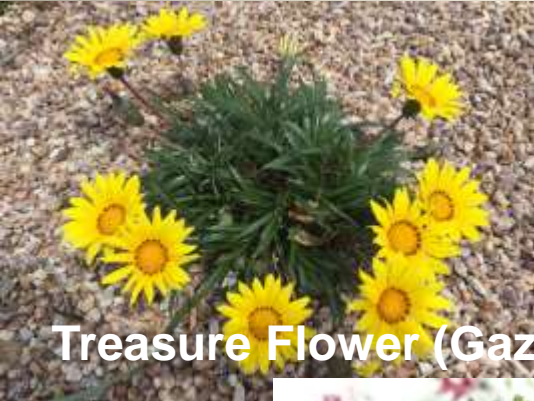
Treasure Flower (Gazania)