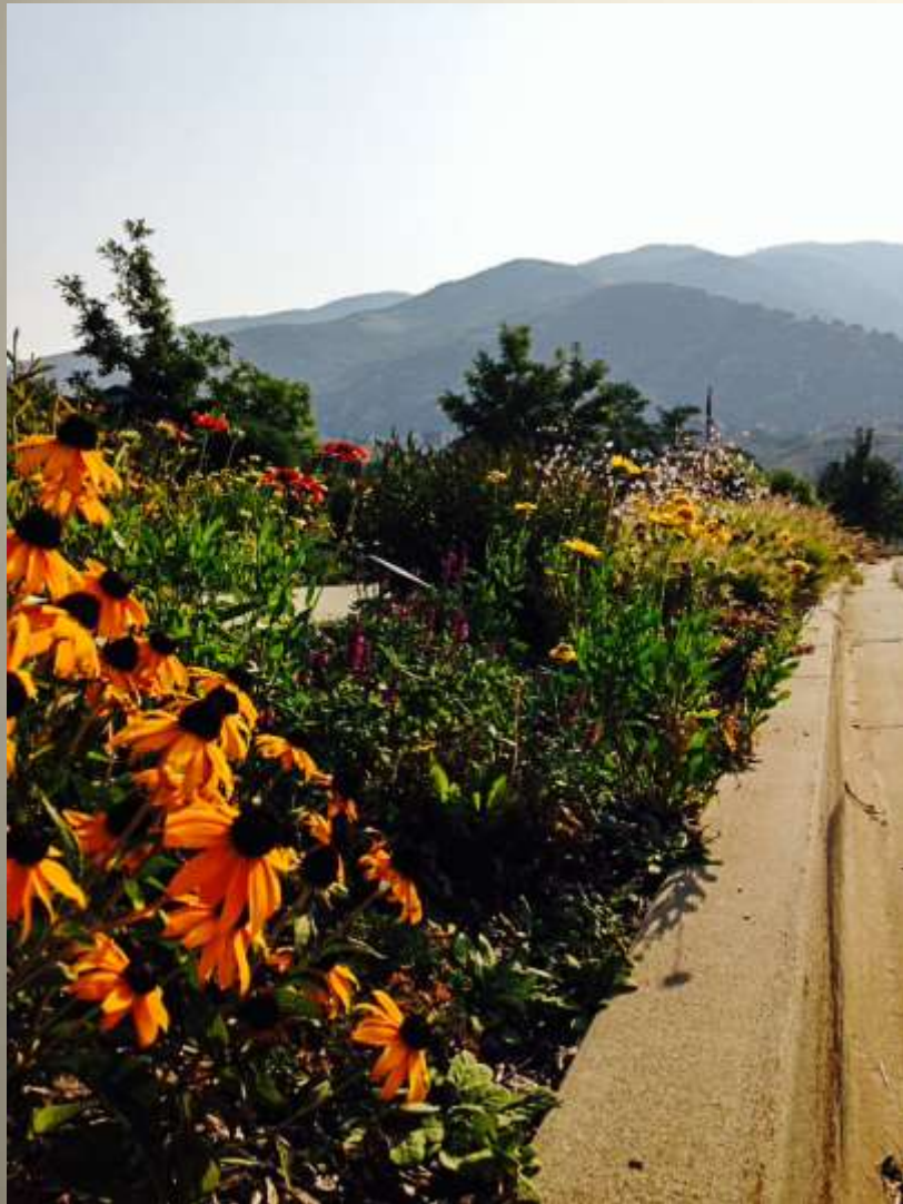
Black Eyed Susan, Burgundy and Amber Wheels Blanketflower, Meadow Sage, Gaura, Fountain Grass