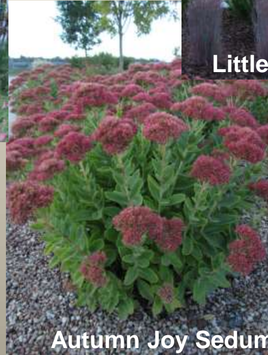
Autumn Joy Sedum