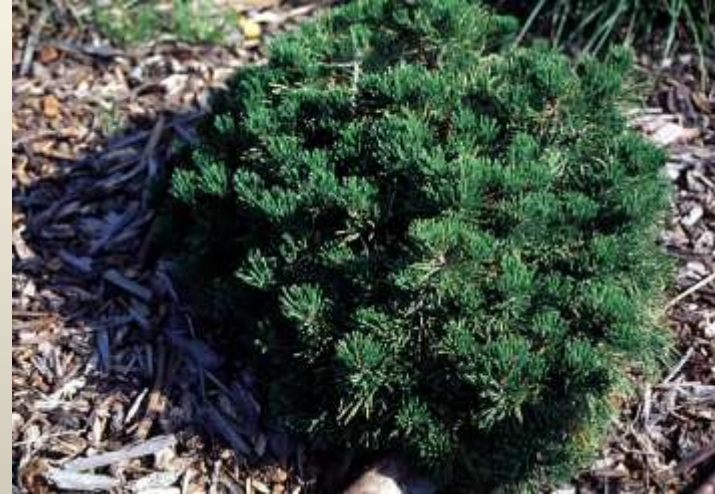
'Mops' mugo pine