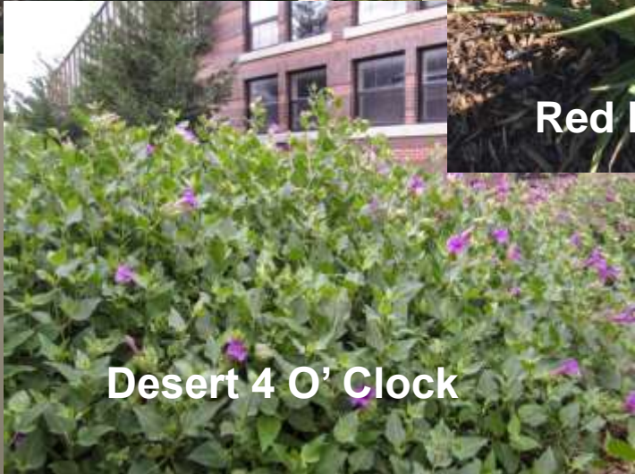
Desert 4 O' Clock