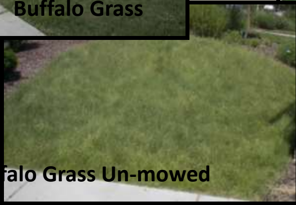
Buffalo Grass Un-mowed