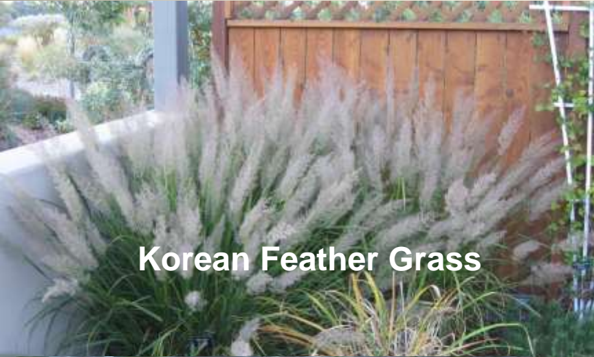
Korean Feather Grass