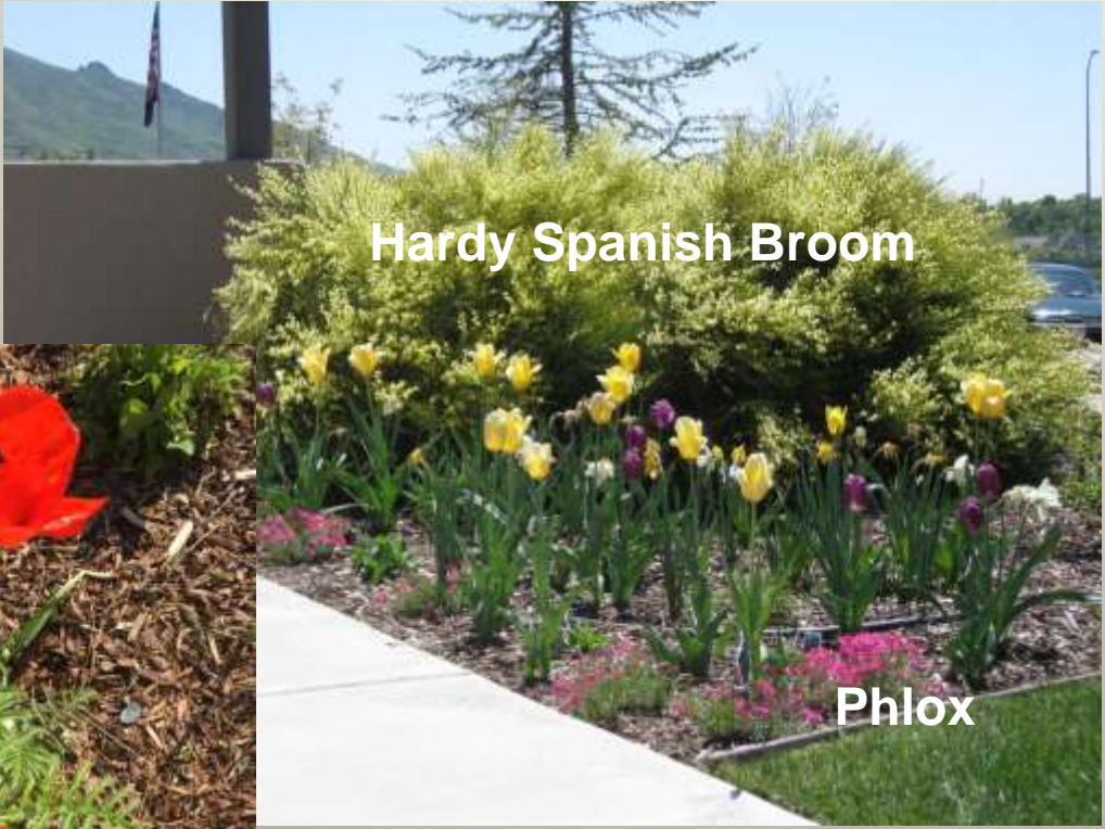
Hardy Spanish Broom